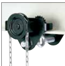
Trolleys & Trolley clamps

Information about products for explosion endangered environments can be found on pages 43-45, Information about corrosion protection can be found on page 42.