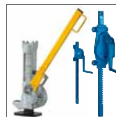
Rack & Pinion jacks

! Please note our user instructions at the beginning of each chapter.