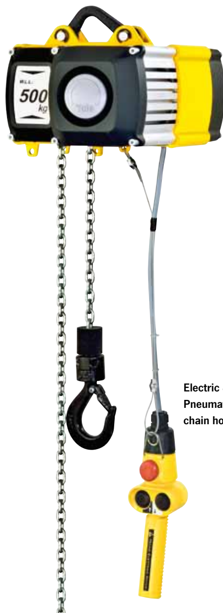
Electric & Pneumatic chain hoists