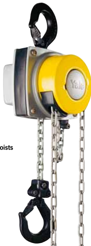
Hand chain hoists