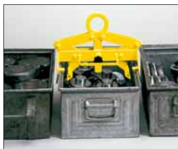
Model TKA.../...i internal operating