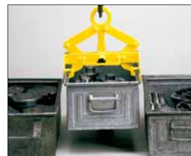
Model TKA.../...i internal operating

Please provide the crate dimensions or a sample crate when ordering.