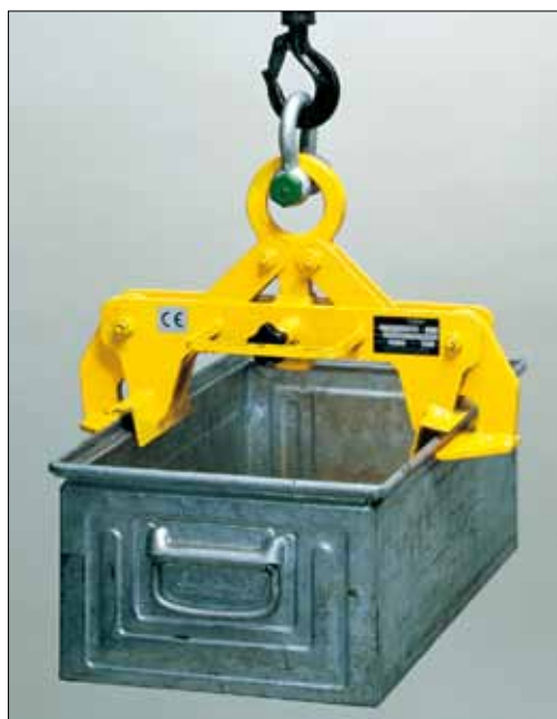
Model TKA.../...a external operating

The crate grab is available as an external or internal operating grab.