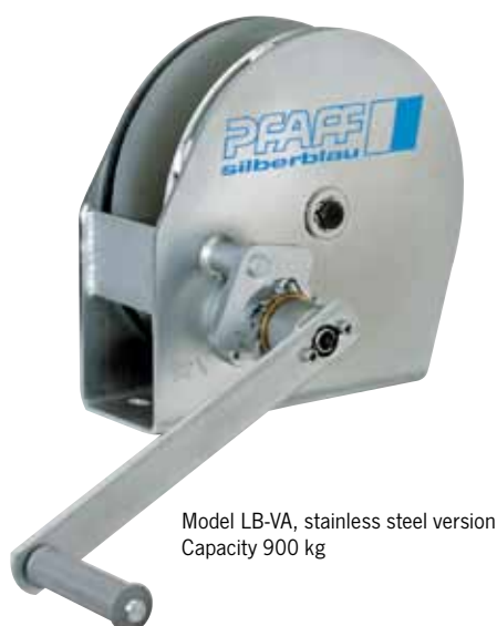
Model LB-VA, stainless steel version Capacity 900 kg