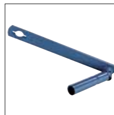
Option: Foldable crank with tiltable handle for use in confined spaces.