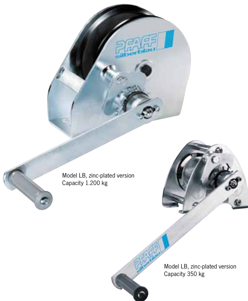
Model LB, zinc-plated version Capacity 1.200 kg